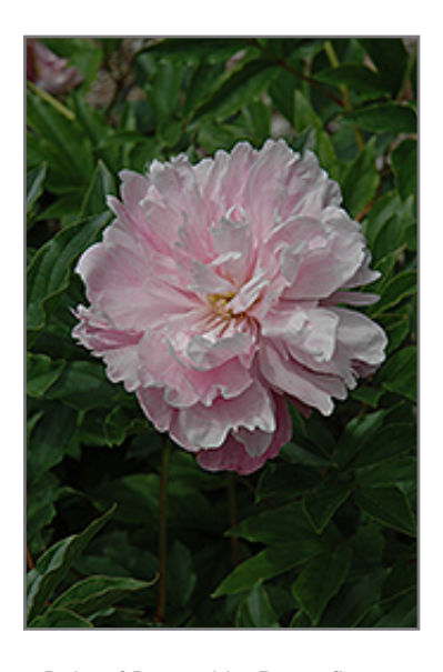
Duke of Devonshire Peony flowers

Duke of Devonshire Peony will grow to be about 30 inches tall at maturity, with a spread of 3 feet. When grown in masses or used as a bedding plant, individual plants should be spaced approximately 30 inches apart. The flower stalks can be weak and so it may require staking in exposed sites or excessively rich soils. It grows at a slow rate, and under ideal conditions can be expected to live for approximately 20 years. As an herbaceous perennial, this plant will usually die back to the crown each winter, and will regrow from the base each spring. Be careful not to disturb the crown in late winter when it may not be readily seen!