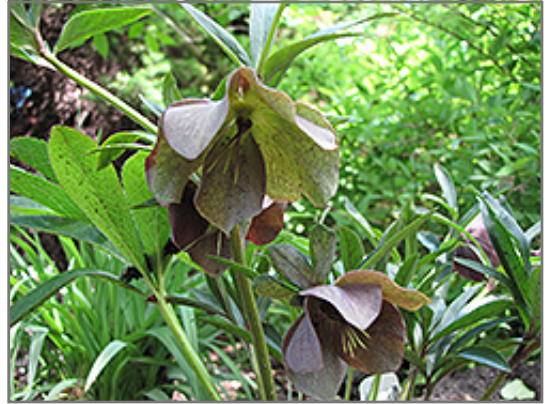
Harvington Shades of Night Hellebore flowers