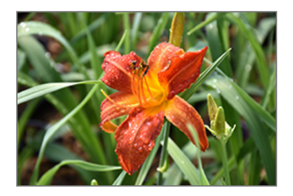
Anzac Daylily flowers

361 N. Hunter Highway Drums, PA 18222 (570) 788-4181 www.beechwood-gardens.com