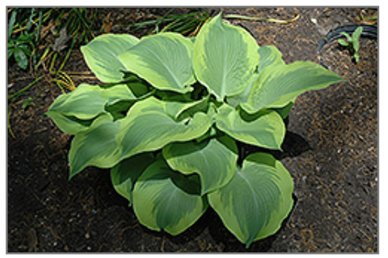
Climax Hosta

361 N. Hunter Highway Drums, PA 18222 (570) 788-4181 www.beechwood-gardens.com