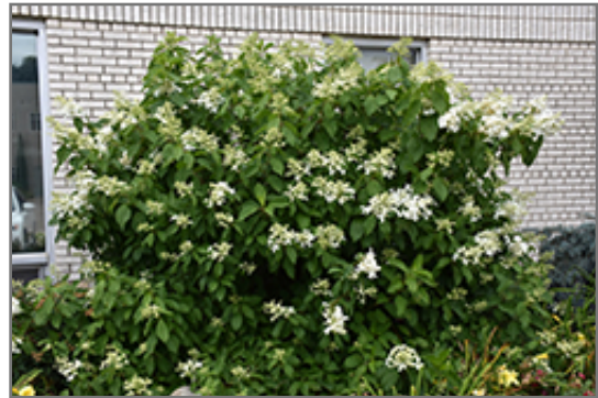
Great Star Hydrangea in bloom