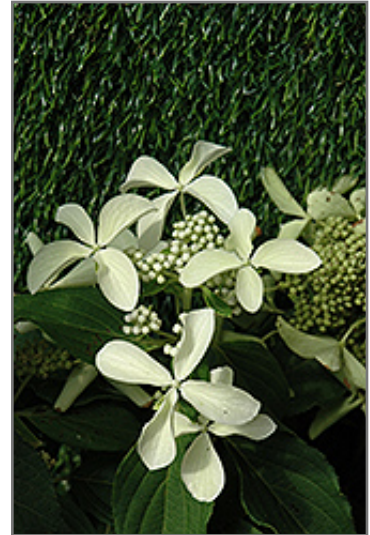
Great Star Hydrangea flowers

* This is a 'special order' plant - contact store for details