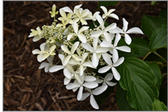
Great Star Hydrangea flowers