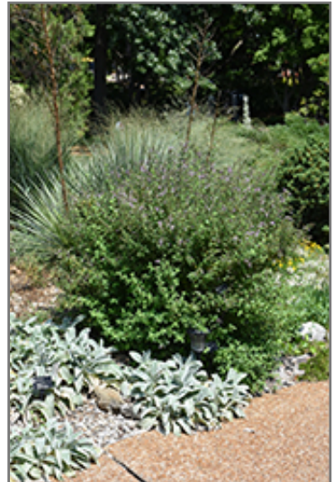
Leptodermis in bloom