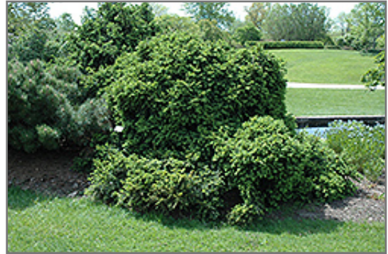
Tolleymore Spruce

Tolleymore Spruce will grow to be about 3 feet tall at maturity, with a spread of 5 feet. It tends to fill out right to the ground and therefore doesn't necessarily require facer plants in front. It grows at a slow rate, and under ideal conditions can be expected to live for 50 years or more.