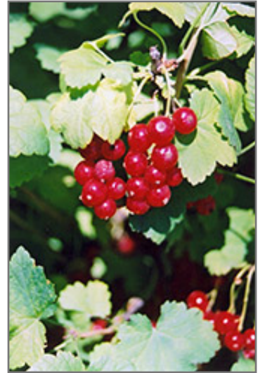
Red Currant fruit