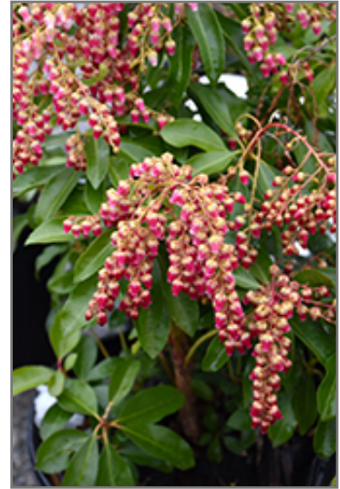
Valley Valentine Japanese Pieris flowers

Valley Valentine Japanese Pieris is recommended for the following landscape applications;