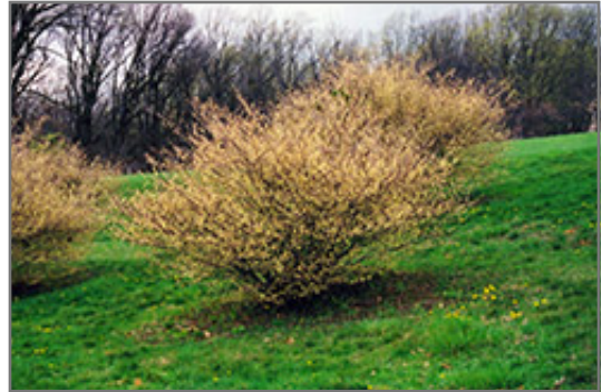
Fragrant Winterhazel in bloom