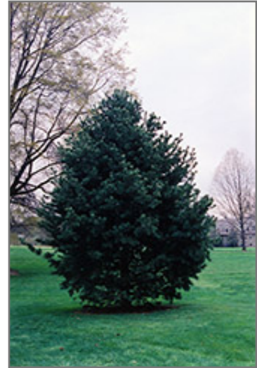
Blue Limber Pine

Blue Limber Pine will grow to be about 50 feet tall at maturity, with a spread of 30 feet. It has a low canopy with a typical clearance of 4 feet from the ground, and should not be planted underneath power lines. It grows at a slow rate, and under ideal conditions can be expected to live to a ripe old age of 100 years or more; think of this as a heritage tree for future generations!