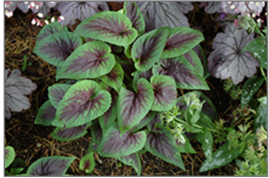
Heartthrob Violet