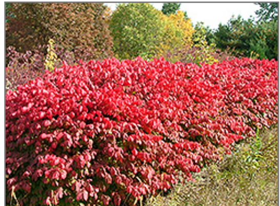
Pipsqueak Winged Burning Bush in fall