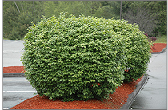
Pipsqueak Winged Burning Bush