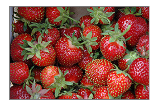
Chandler Strawberry fruit

Chandler Strawberry features dainty white daisy flowers with yellow eyes along the stems in mid spring. Its tomentose round compound leaves remain green in color throughout the season. It features an abundance of magnificent cherry red berries in early summer.