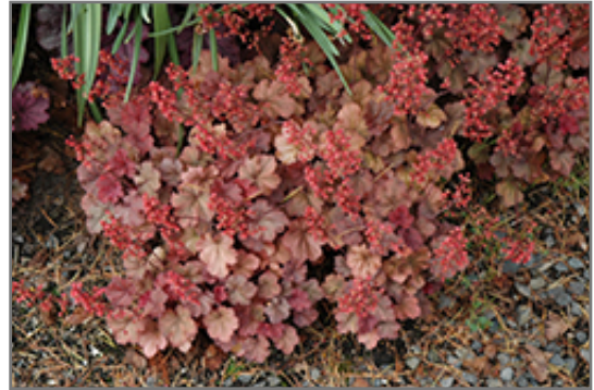
Cherry Cola Coral Bells in bloom

Cherry Cola Coral Bells is recommended for the following landscape applications;