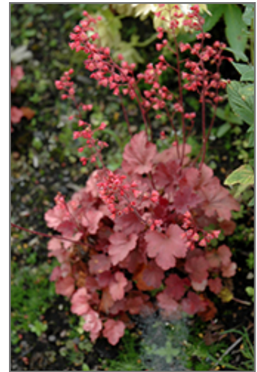
Cherry Cola Coral Bells