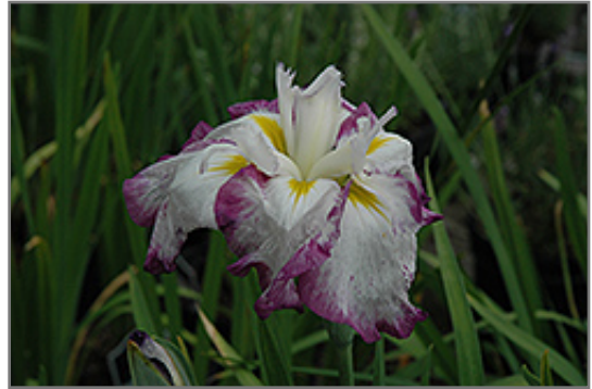
Freckled Geisha Japanese Flag Iris flowers