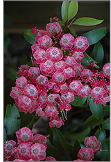
Pink Charm Mountain Laurel flowers

Pink Charm Mountain Laurel will grow to be about 10 feet tall at maturity, with a spread of 10 feet. It has a low canopy with a typical clearance of 1 foot from the ground, and is suitable for planting under power lines. It grows at a slow rate, and under ideal conditions can be expected to live for 50 years or more.