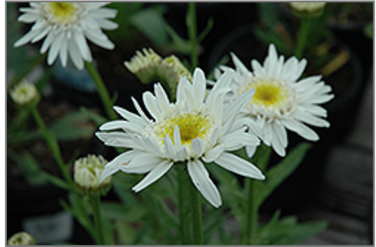
Christine Hagemann Shasta Daisy flowers