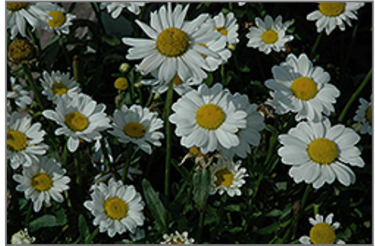
May Queen Shasta Daisy flowers