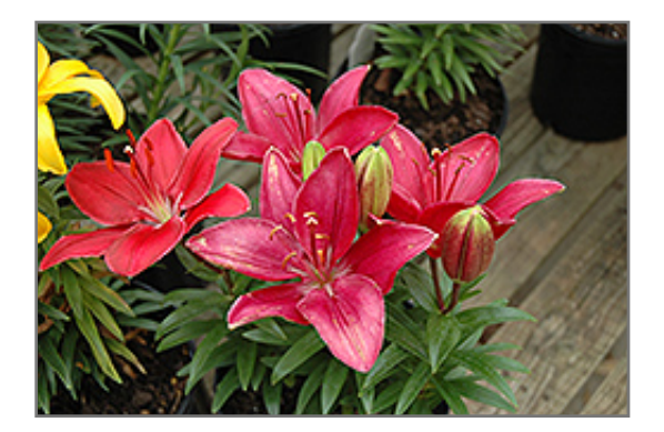
Buzzer Lily flowers