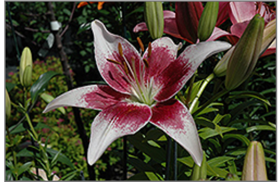
Strawberries And Cream Lily flowers