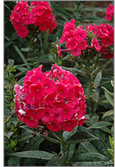
Watermelon Punch Garden Phlox flowers

Elegant summer blooms of fragrant pink flowers with white centres, on compact plants suitable for containers or small perennial borders; good mildew resistance