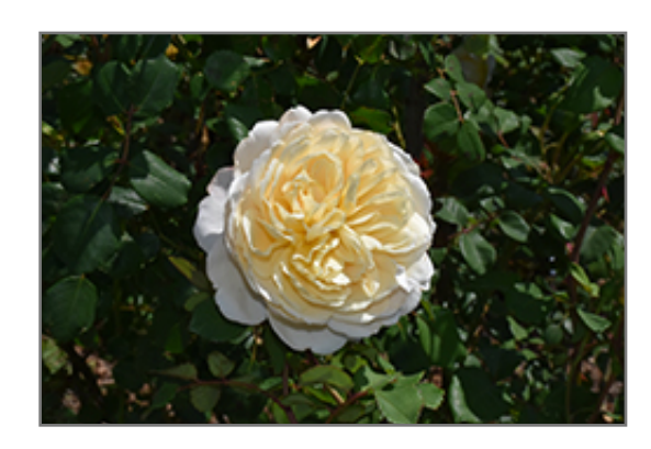
Crocus Rose flowers

Crocus Rose features showy fragrant peach flowers with creamy white overtones at the ends of the branches from late spring to early fall. The flowers are excellent for cutting. It has forest green deciduous foliage. The glossy oval compound leaves do not develop any appreciable fall color.