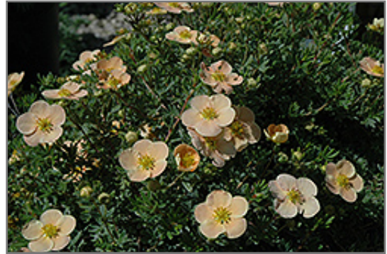
Day Dawn Potentilla flowers

Day Dawn Potentilla will grow to be about 3 feet tall at maturity, with a spread of 3 feet. It tends to fill out right to the ground and therefore doesn't necessarily require facer plants in front. It grows at a slow rate, and under ideal conditions can be expected to live for approximately 30 years.