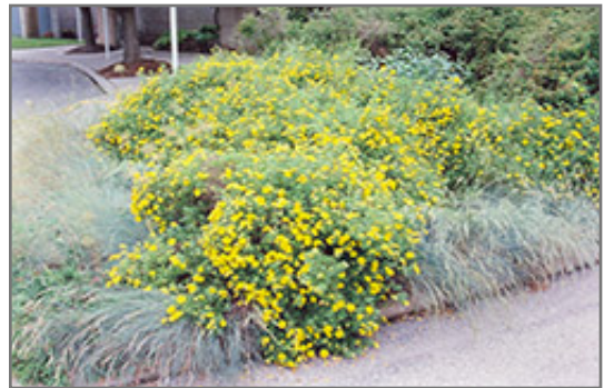
Goldfinger Potentilla in bloom