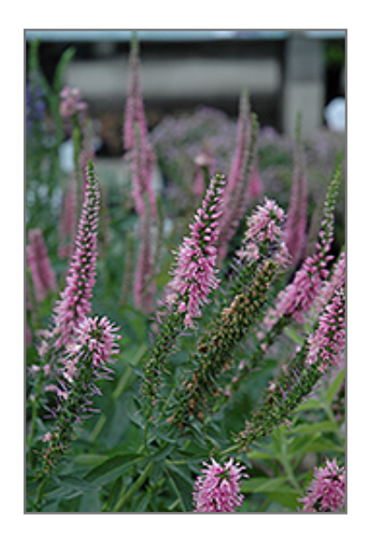
Baby Doll Speedwell flowers