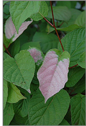
September Sun Kiwi foliage

September Sun Kiwi is recommended for the following landscape applications;