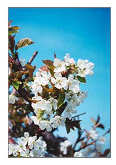
Bing Cherry flowers