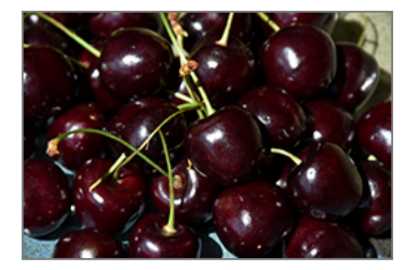
Bing Cherry fruit