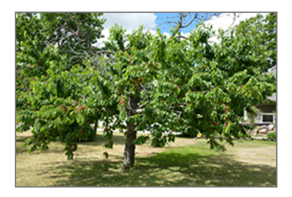
Bing Cherry fruit

This is a deciduous tree with a shapely oval form. Its average texture blends into the landscape, but can be balanced by one or two finer or coarser trees or shrubs for an effective composition. This plant will require occasional maintenance and upkeep, and is best pruned in late winter once the threat of extreme cold has passed. It is a good choice for attracting birds to your yard. Gardeners should be aware of the following characteristic(s) that may warrant special consideration;