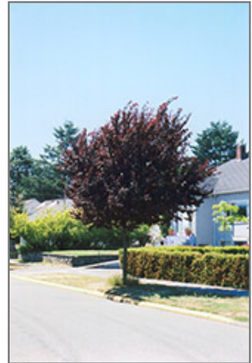
Newport Plum