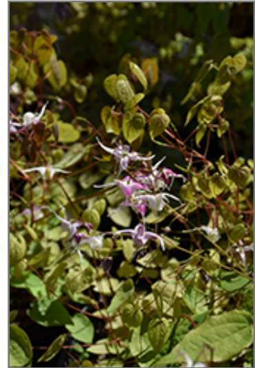
Tama No Genpei Bishop's Hat flowers