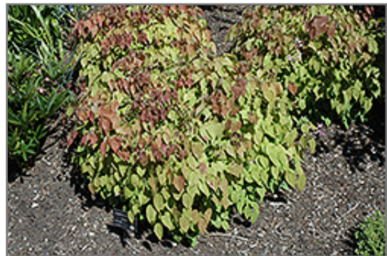
Tama No Genpei Bishop's Hat in bloom