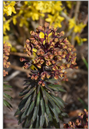
Purple Wood Spurge flower buds