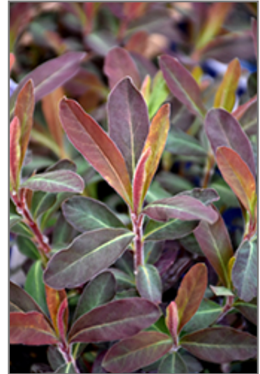
Purple Wood Spurge foliage

* This is a 'special order' plant - contact store for details