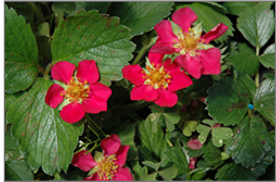
Beach Strawberry flowers