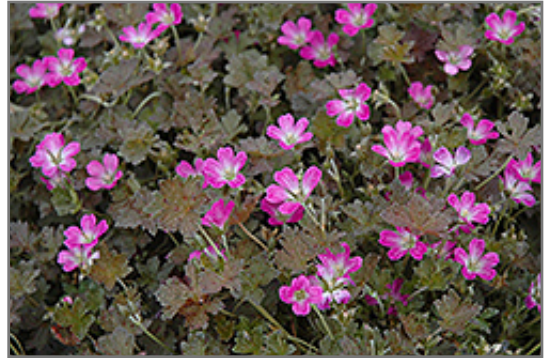
Orkney Cherry Dwarf Cranesbill flowers