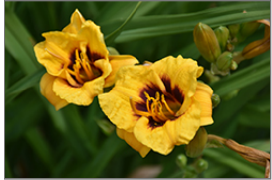
Lightning Bug Daylily flowers

Striking gold trumpets with a deep burgundy throat; provides a bold contrast to other plants; sturdy, strong, easy to care for, great grassy texture and form; a stunning display when massed in the garden