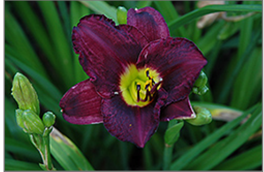
Pygmy Plum Daylily flowers