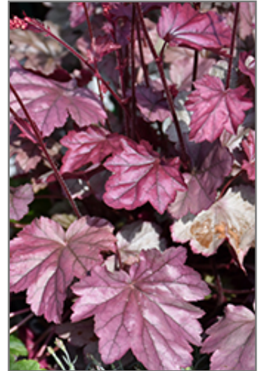
Stainless Steel Coral Bells foliage