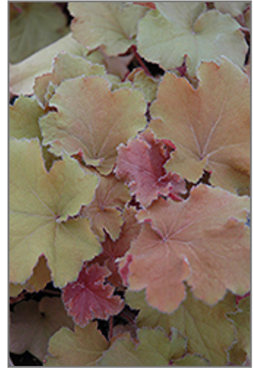
Big Top Gold Coral Bells foliage

Dainty spikes of creamy bells rise from a large, dense mound of coppery green foliage, contrasted by purple-red undersides; amazing color addition with great versatility; keep soil moist in heat of summer