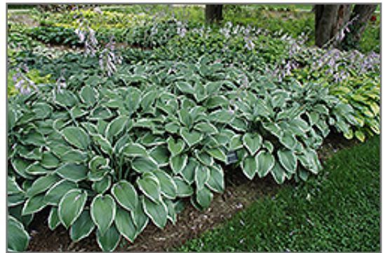
Winter Snow Hosta in bloom