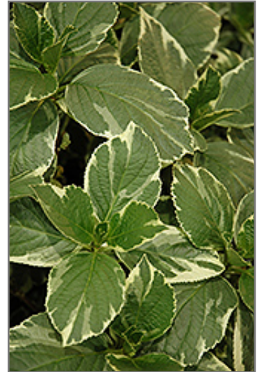
Guilded Gold Hydrangea foliage