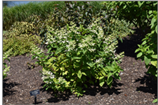
Passionate Hydrangea in bloom