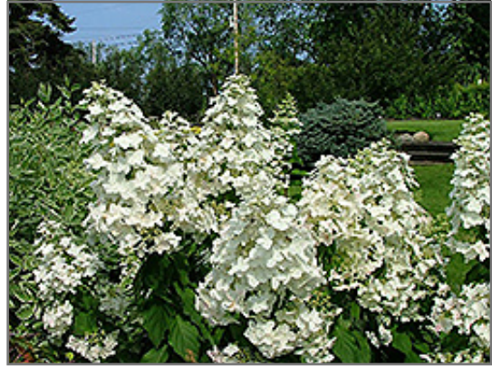
Passionate Hydrangea flowers