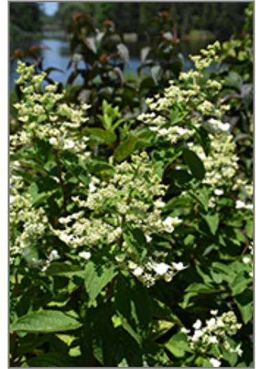
Passionate Hydrangea flowers

* This is a 'special order' plant - contact store for details