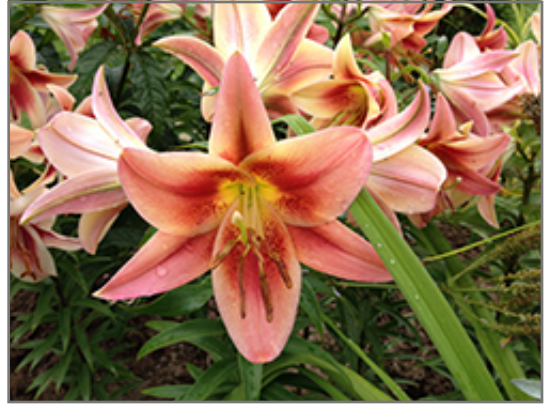
Montego Bay Lily flowers