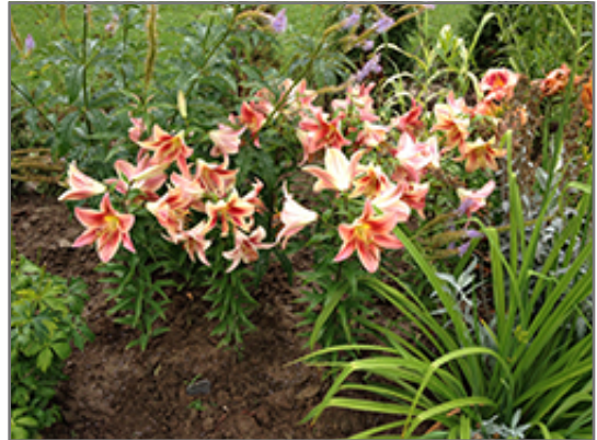
Montego Bay Lily in bloom