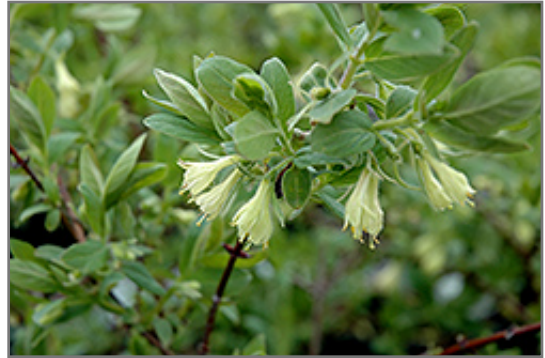
Tundra Honeyberry flowers

* This is a 'special order' plant - contact store for details