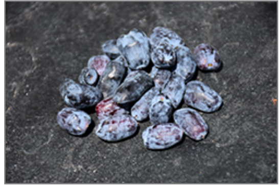
Tundra Honeyberry fruit

Tundra Honeyberry features subtle creamy white flowers along the branches in early spring. It has green deciduous foliage. The narrow leaves do not develop any appreciable fall color. It features an abundance of magnificent blue berries in late spring.