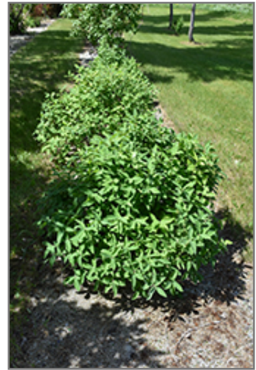
Tundra Honeyberry