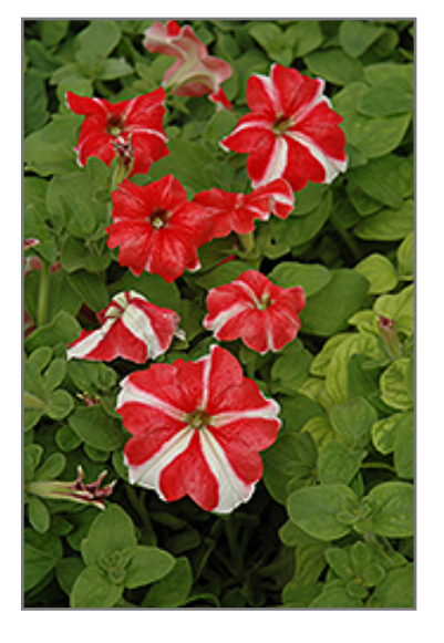
Ultra Red Star Petunia flowers

361 N. Hunter Highway Drums, PA 18222 (570) 788-4181 www.beechwood-gardens.com