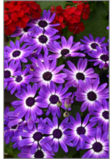
Senetti Blue Bicolor Pericallis flowers

Senetti Blue Bicolor Pericallis is recommended for the following landscape applications;