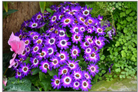
Senetti Blue Bicolor Pericallis flowers