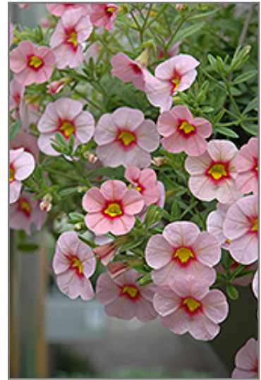
Aloha Tiki Soft Pink Calibrachoa flowers