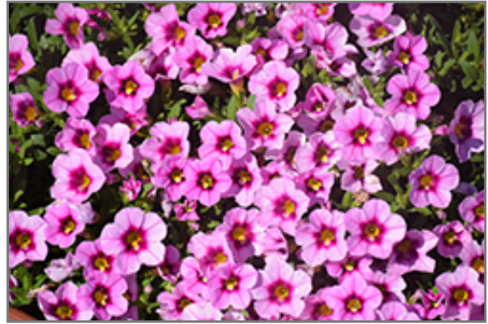
Aloha Tiki Soft Pink Calibrachoa flowers

This plant will require occasional maintenance and upkeep. Trim off the flower heads after they fade and die to encourage more blooms late into the season. It is a good choice for attracting bees and hummingbirds to your yard, but is not particularly attractive to deer who tend to leave it alone in favor of tastier treats. It has no significant negative characteristics.