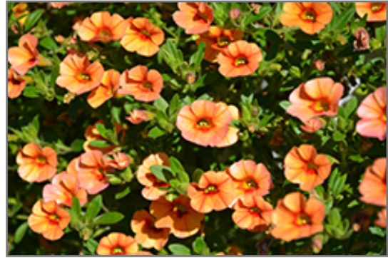
Can-Can Apricot Calibrachoa flowers

Can-Can Apricot Calibrachoa is recommended for the following landscape applications;