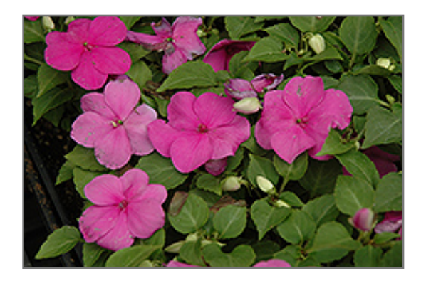
Super Elfin Lilac Impatiens flowers

361 N. Hunter Highway Drums, PA 18222 (570) 788-4181 www.beechwood-gardens.com