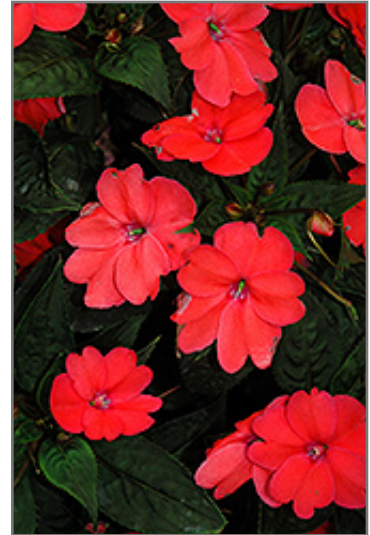
SunPatiens Compact Coral New Guinea Impatiens flowers

SunPatiens Compact Coral New Guinea Impatiens is recommended for the following landscape applications;