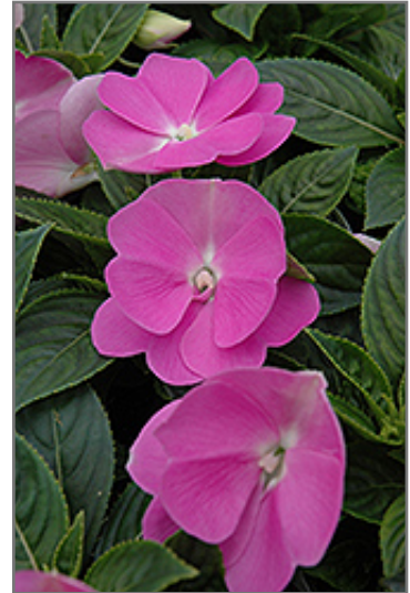
Celebrette Lavender New Guinea Impatiens flowers

Celebrette Lavender New Guinea Impatiens is recommended for the following landscape applications;