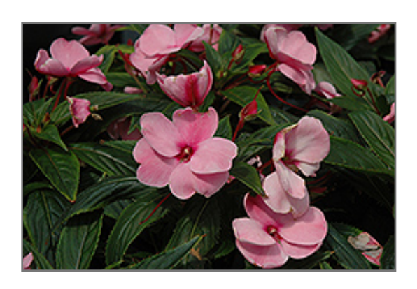
Posh Pink New Guinea Impatiens flowers